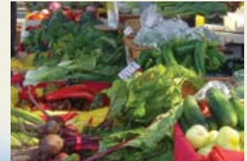
Farmer's Market in the Village