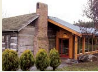
Orcas Island Historical Museum

The horseshoe shape of Orcas Island means you are never far from a beautiful vista of the sea. As the biggest island in the county, the drives on Orcas are a little longer, and the pace a little slower. Gasoline is available near Eastsound at the corner of Crescent Beach and Olga Roads.