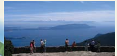
Mt. Constitution in Moran Park