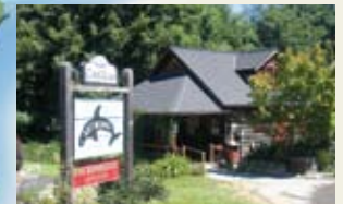
Orcas Island Artworks at Olga