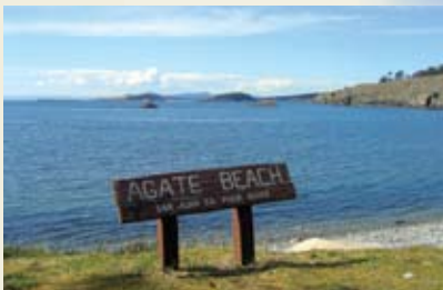
Agate Beach County Park