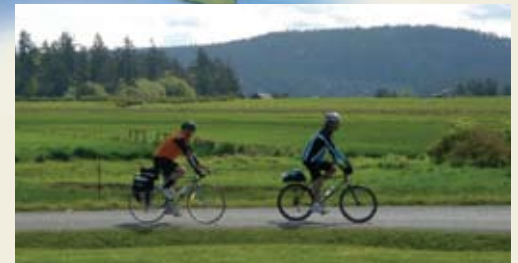
"Tour de Lopez" takes place each April.