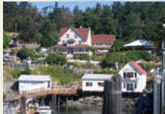
Orcas Village at the ferry landing.