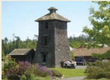
Lopez Village Picnic