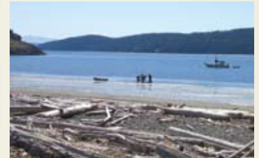
Spencer Spit State Park