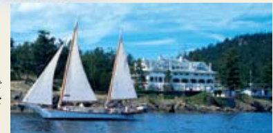
Rosario Resort and Spa