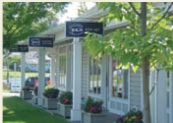
Lopez Village shops