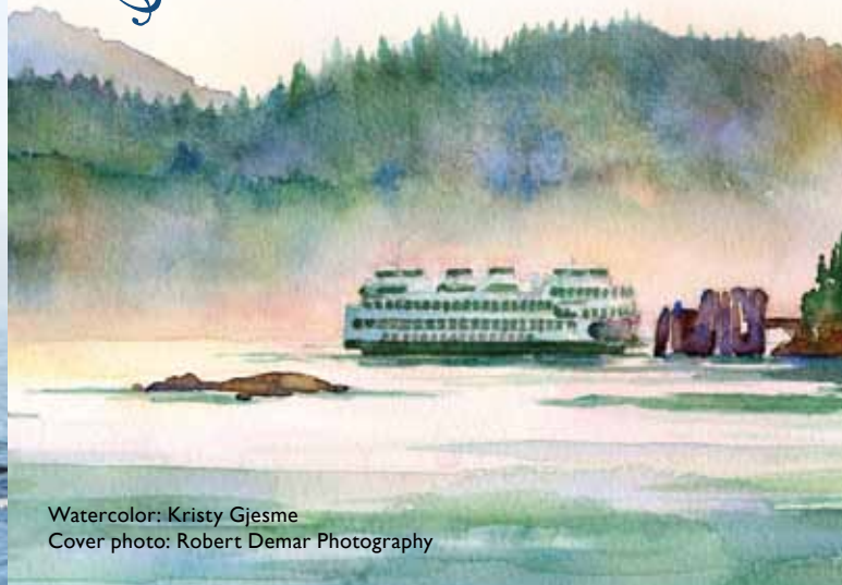
Watercolor: Kristy Gjesme