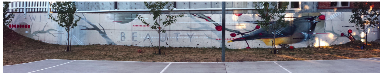
Witness the Beauty by Jake Wagoner

Restaurants and bars feature live music, usually by local artists. Free outdoor concerts are held during the summer at both the San Juan Historical Museum and the Port of Friday Harbor's waterfront park.